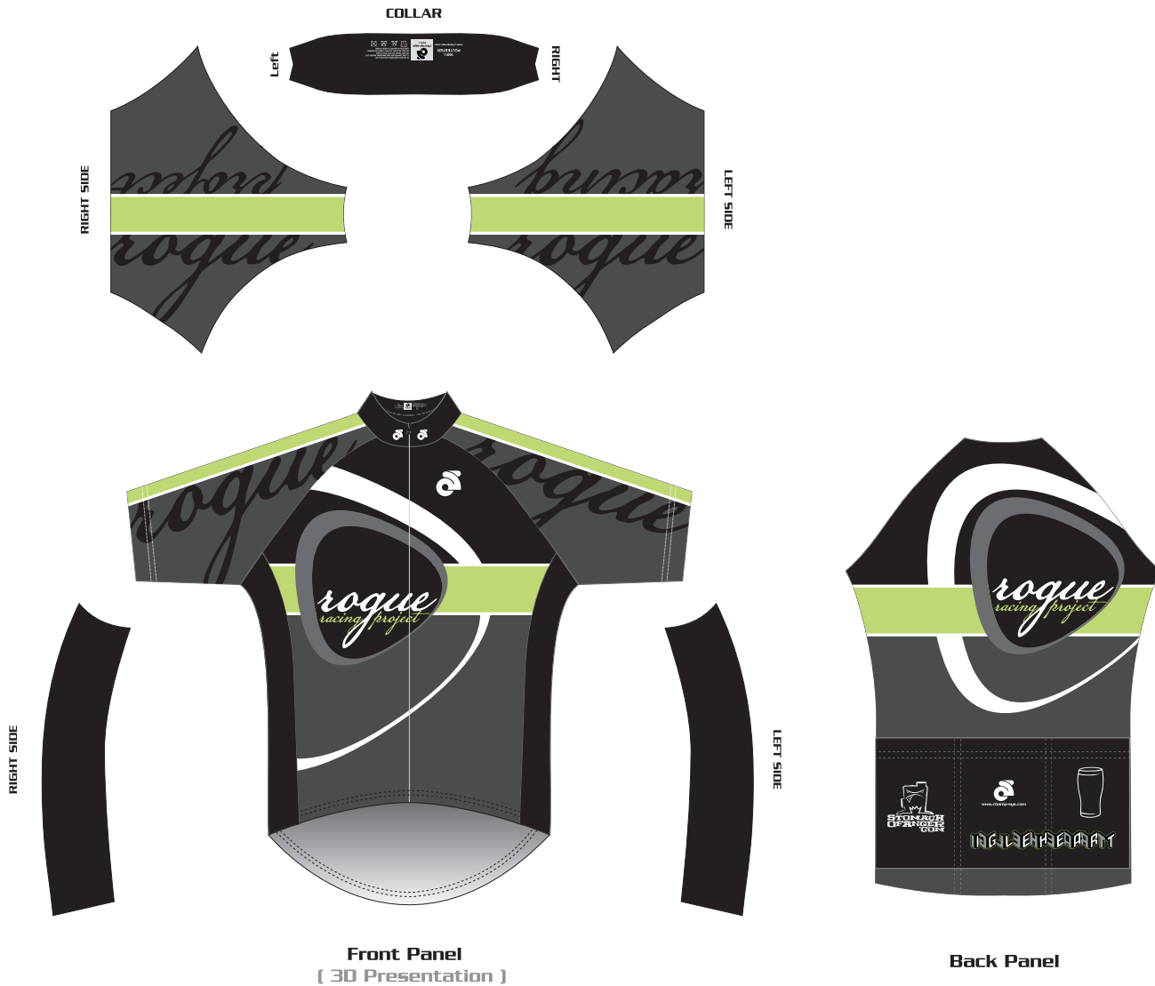
Front Panel ( 3D Presentation )

Raglan Short Sleeves Jersey Template ● With Side Panel